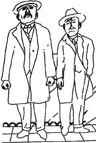
Illustration: Detail of Bartolomeo Vanzetti and Nicola Sacco from the cartoon of a mural by Ben Shahn.